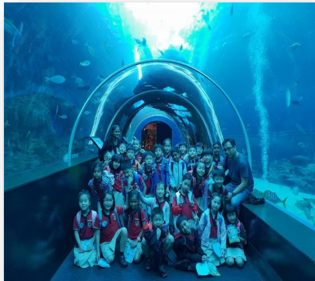
Learning Journey to Sea Aquarium