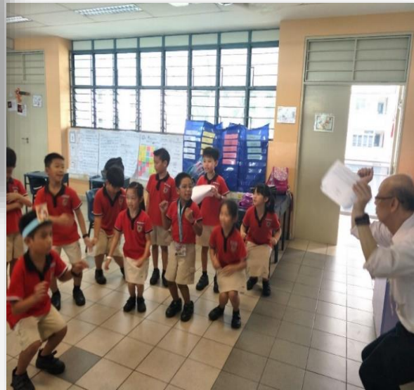
Oracy Enrichment Sessions